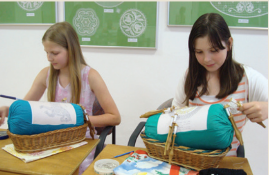
Making of bobbin lace, 2015

Slovenia ratified UNESCO Convention for the Safeguarding of the Intangible Cultural Heritage in 2008. The main institution concerned with the safeguarding of intangible cultural heritage in Slovenia is the Slovene Ethnographic Museum, which since 2011 performs the role of the national Coordinator for the Safeguarding of the Intangible Cultural Heritage. The Register of the Intangible Cultural Heritage kept by the Ministry of Culture has been taking shape since 2008. By the end of 2017 it contained 61 elements, 10 of which have been declared an intangible cultural heritage of national significance and 2 of them have been inscribed on the UNESCO Representative List of the Intangible Cultural Heritage of Humanity .