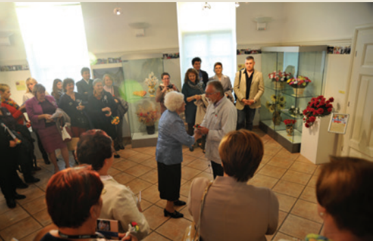
Exhibition Traditional Making of Paper Flowers, Slovene Ethnographic Museum, 2014

nominations and maintains contacts with institutions responsible for the safeguarding of intangible cultural heritage abroad. The various activities of the Coordinator, such as exhibitions, public events, publications and professional gatherings, have undoubtedly enhanced awareness of the importance of intangible cultural heritage in Slovenia and bearers are increasingly interested in being entered in the Register.