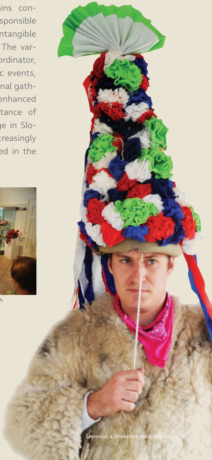
Škoromat, a Shrovetide mask, Hrušica, 2014