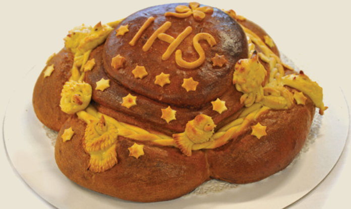
Traditional Christmas bread, Velike Lašče, 2014

Slovenia ratified UNESCO Convention for the Safeguarding of the Intangible Cultural Heritage in 2008. The main institution concerned with the safeguarding of intangible cultural heritage in Slovenia is the Slovene Ethnographic Museum, which since 2011 performs the role of the national Coordinator for the Safeguarding of the Intangible Cultural Heritage. The Register of the Intangible Cultural Heritage kept by the Ministry of Culture has been taking shape since 2008. By the end of 2017 it contained 61 elements, 10 of which have been declared an intangible cultural heritage of national significance and 2 of them have been inscribed on the UNESCO Representative List of the Intangible Cultural Heritage of Humanity .