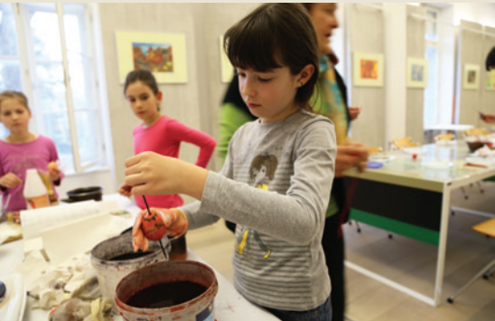
Making Easter eggs workshop, Slovene Ethnographic Museum, 2015

Since 2011, the Slovene Ethnographic Museum has been carrying out the duties of the national Coordinator for the Safeguarding of the Intangible Cultural Heritage. Museum staff are active in the field, preserving or re-establishing contacts with bearers of intangible cultural heritage, providing them with advice on safeguarding, assisting in the process of writing applications for the Register and engaging in education. The Coordinator participates in the preparation of UNESCO