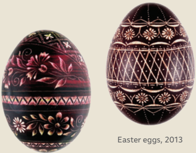
Easter eggs, 2013