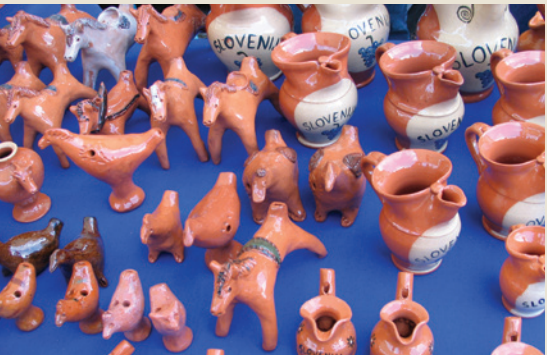
Traditional pottery, 2014