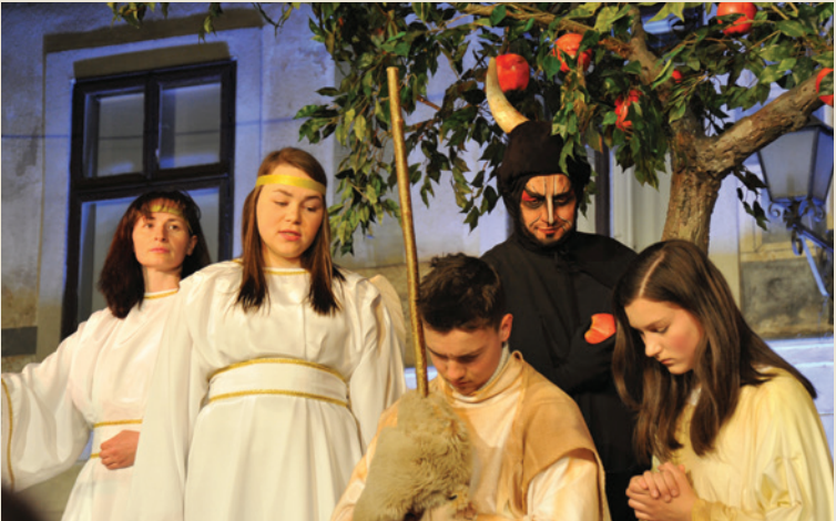
Škofja Loka Passion Play (2016) Škofja Loka, 2015