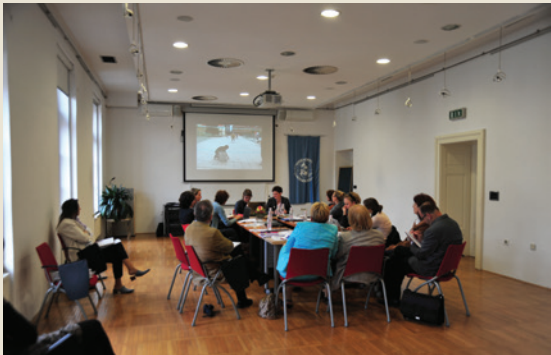
International expert meeting, Slovene Ethnographic Museum, 2013

nominations and maintains contacts with institutions responsible for the safeguarding of intangible cultural heritage abroad. The various activities of the Coordinator, such as exhibitions, public events, publications and professional gatherings, have undoubtedly enhanced awareness of the importance of intangible cultural heritage in Slovenia and bearers are increasingly interested in being entered in the Register.