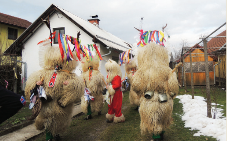
Door-to-door Rounds of Kurenti (2017) Markovci, 2015