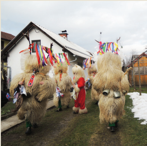
Door-to-door Rounds of Kurenti (2017)