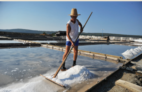
Collecting sea salt, Sečovlje Salina, 2018