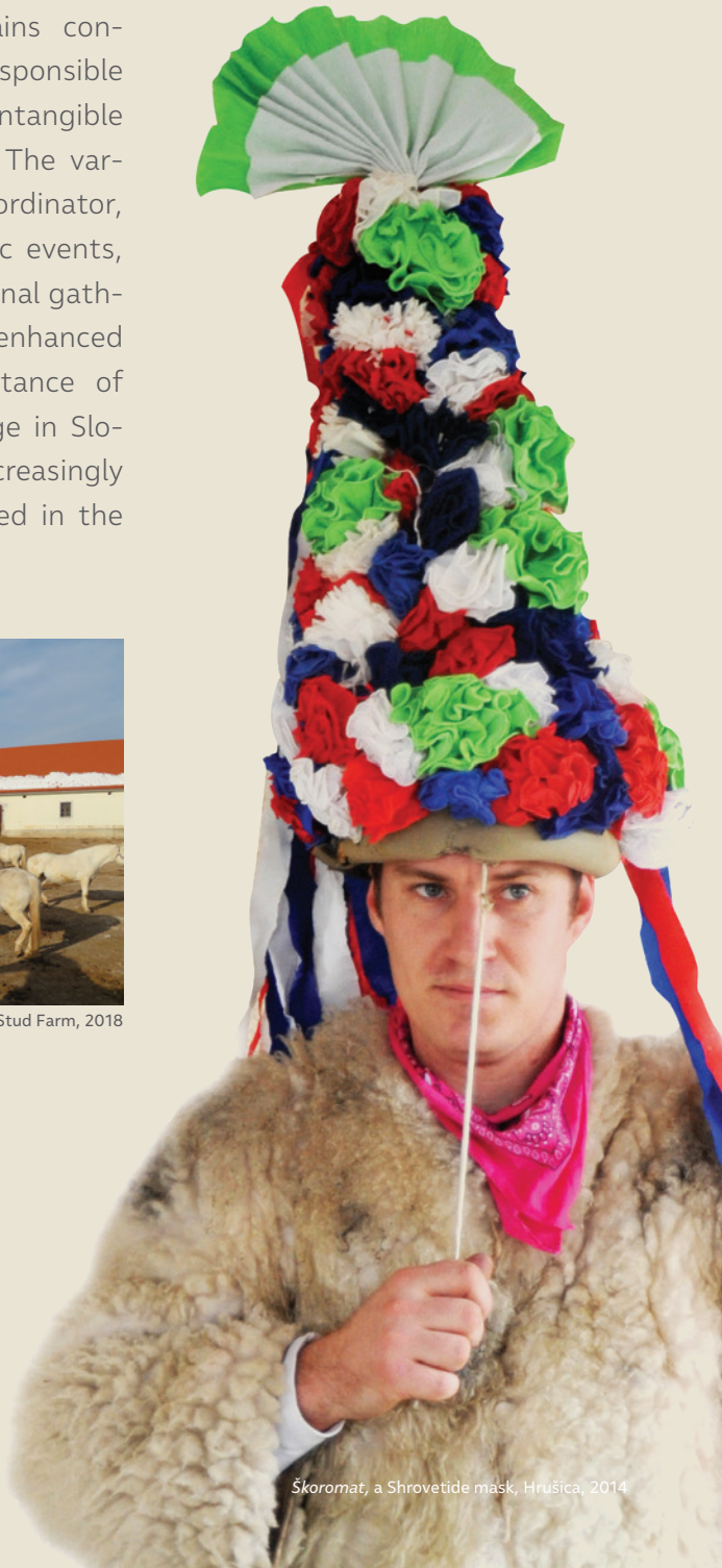
Škoromat, a Shrovetide mask, Hrušica, 2014