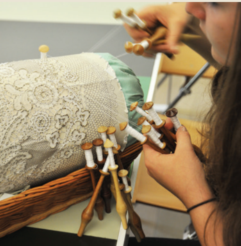
Bobbin Lacemaking in Slovenia (2018)