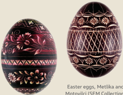
Easter eggs, Metlika and Motovilci (SEM Collection)