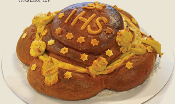
Traditional Christmas bread, Velike Lašče, 2014