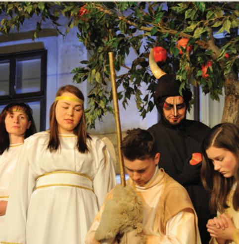
Škofja Loka Passion Play (2016)