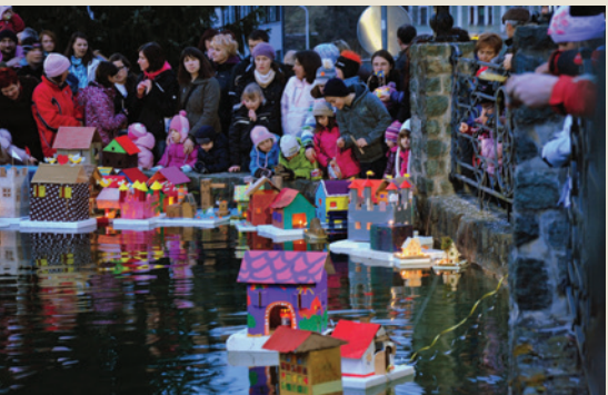
Launching gregorčki models, Kropa, 2013

Slovenia ratified UNESCO Convention for the Safeguarding of the Intangible Cultural Heritage in 2008 and intangible cultural heritage was included in the new Cultural Heritage Protection Act (2008), which had previously included only movable and immovable material heritage. The Register of the Intangible Cultural Heritage kept by the Ministry of Culture has been taking shape since 2008. By the end of 2018, it contained 67 elements, 4 of which have been inscribed on the UNESCO Representative List of the Intangible Cultural Heritage of Humanity . The main institution concerned with the safeguarding of intangible cultural heritage in Slovenia is the Slovene Ethnographic Museum, which fulfils the role of the national Coordinator for the Safeguarding of the Intangible Cultural Heritage.