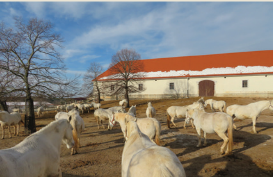
Lipizzan Horses, Lipica Stud Farm, 2018

nominations and maintains contacts with institutions responsible for the safeguarding of intangible cultural heritage abroad. The various activities of the Coordinator, such as exhibitions, public events, publications and professional gatherings, have undoubtedly enhanced awareness of the importance of intangible cultural heritage in Slovenia and bearers are increasingly interested in being entered in the Register.