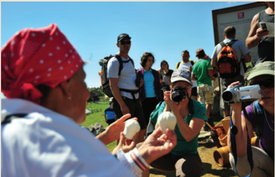
Documenting intangible cultural heritage, Velika planina, 2013

The Slovene Ethnographic Museum was founded in 1923. It is a national institution concerned with documenting, collecting, researching, keeping, safeguarding and presenting the material and intangible cul-