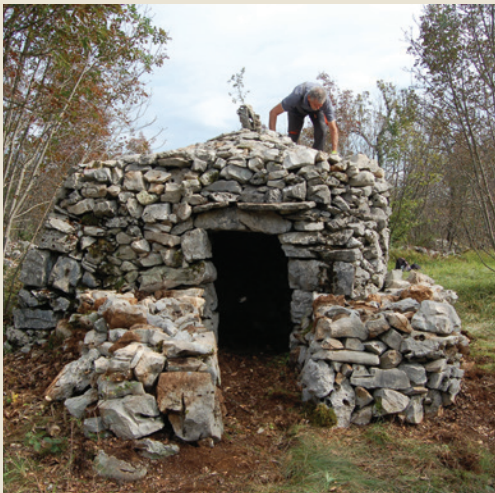
Art of Dry Stone Walling, Knowledge and Techniques (2018)