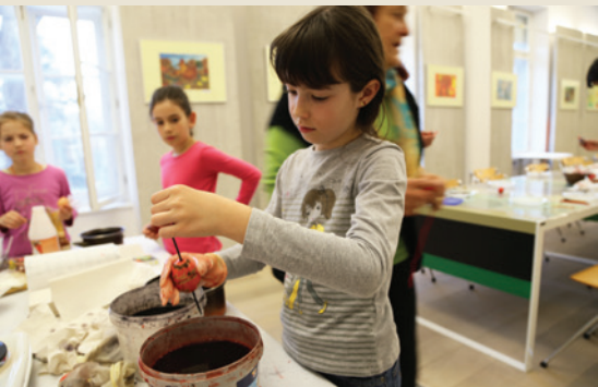
Making Easter eggs workshop, Slovene Ethnographic Museum, 2015